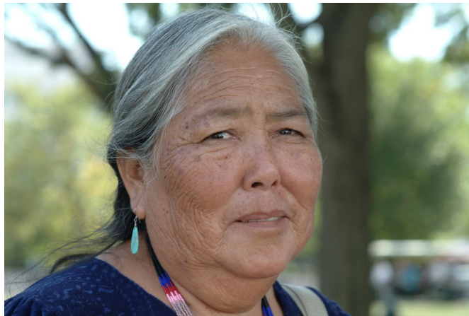
Percent of Iowa's Total American Indian and Alaska Native population: July 1, 2019